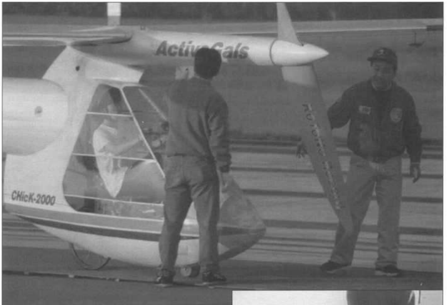
Above: A closer view of the cockpit and propeller of the CHICK-2000 aircraft. Right, Takashi Hattori, right-wing runner; below, Kouta Sata, left-wing runner.